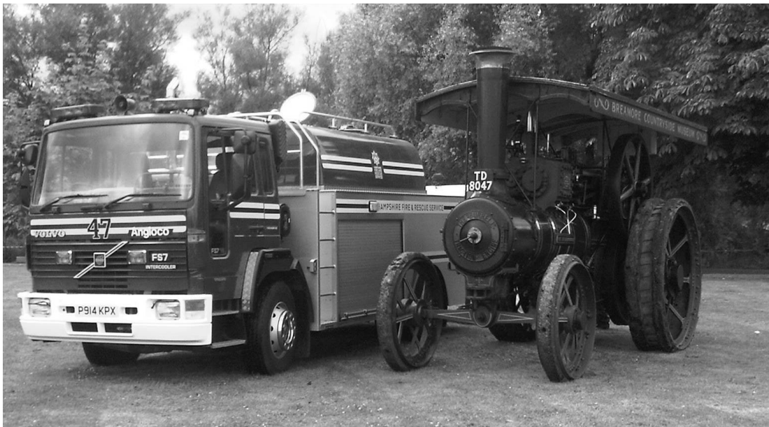
Filling up a Traction Engine at the Fordingbridge Festival – July 2011