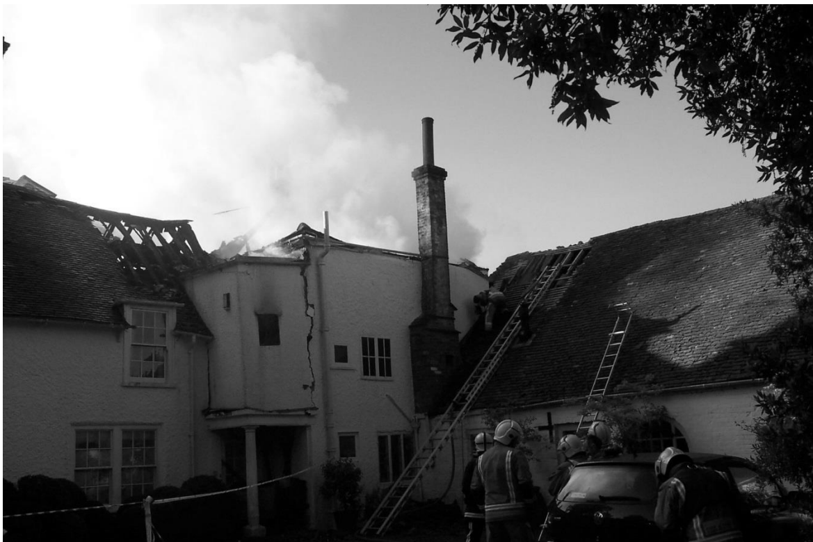
Fryern Court, Tinkers Cross with the damage to the rear of the property clearly visible – 30 th June 2011