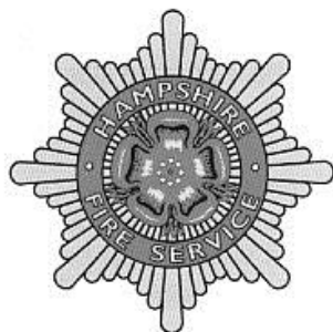
HAMPSHIRE FIRE SERVICE 1948-1974