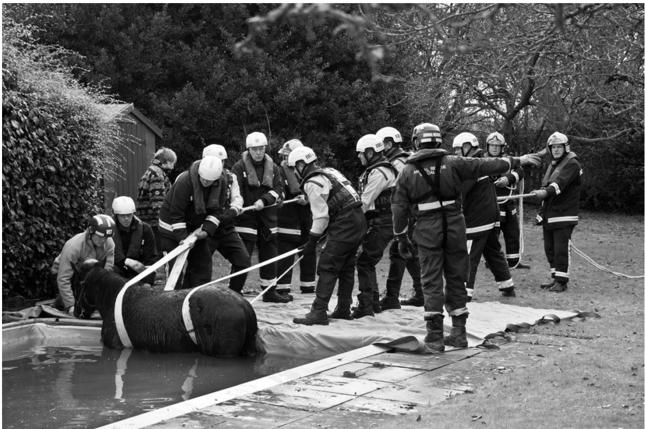
The rescue of Mischief the horse from a swimming pool at Godshill – 23 rd January 2011