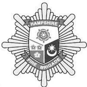
HAMPSHIRE FIRE BRIGADE 1974-1992