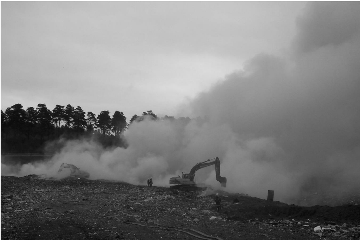
JCB Diggers being used to help put out the 90,000 tonnes of household waste on fire at Blue Haze Landfill Site in Ebblake – 4 th September 2011