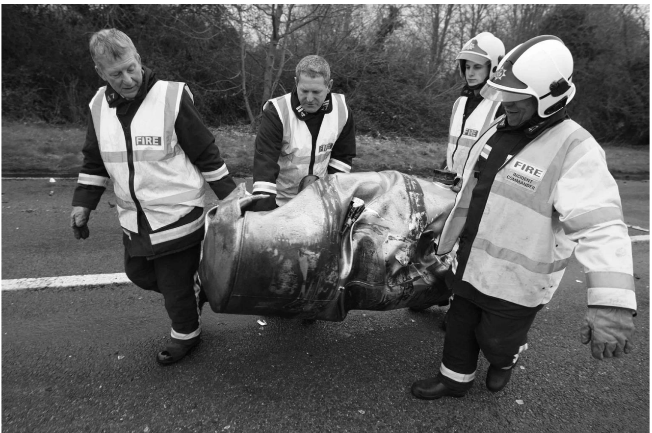
Removing a diesel tank ripped off a lorry after a Road Traffic Collision on the A338 Road, Gorley – 9 th February 2012