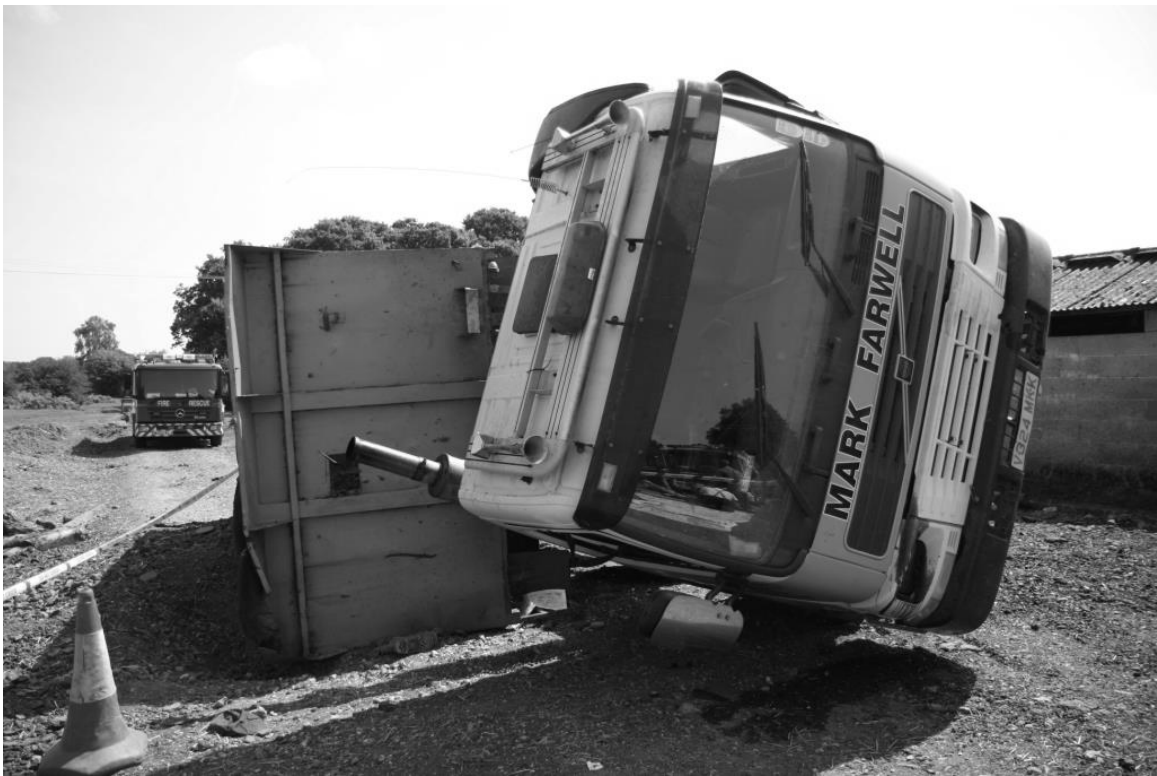
Overturned tipper lorry at Ogdens Dairy Farm from underneath which Fordingbridge firefighters had to release a farmer trapped by his left leg – 4 th July