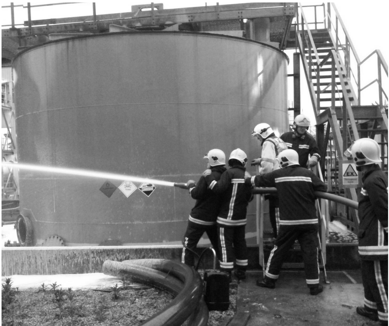
Foam training exercise at Hardley – 9 th May 2012