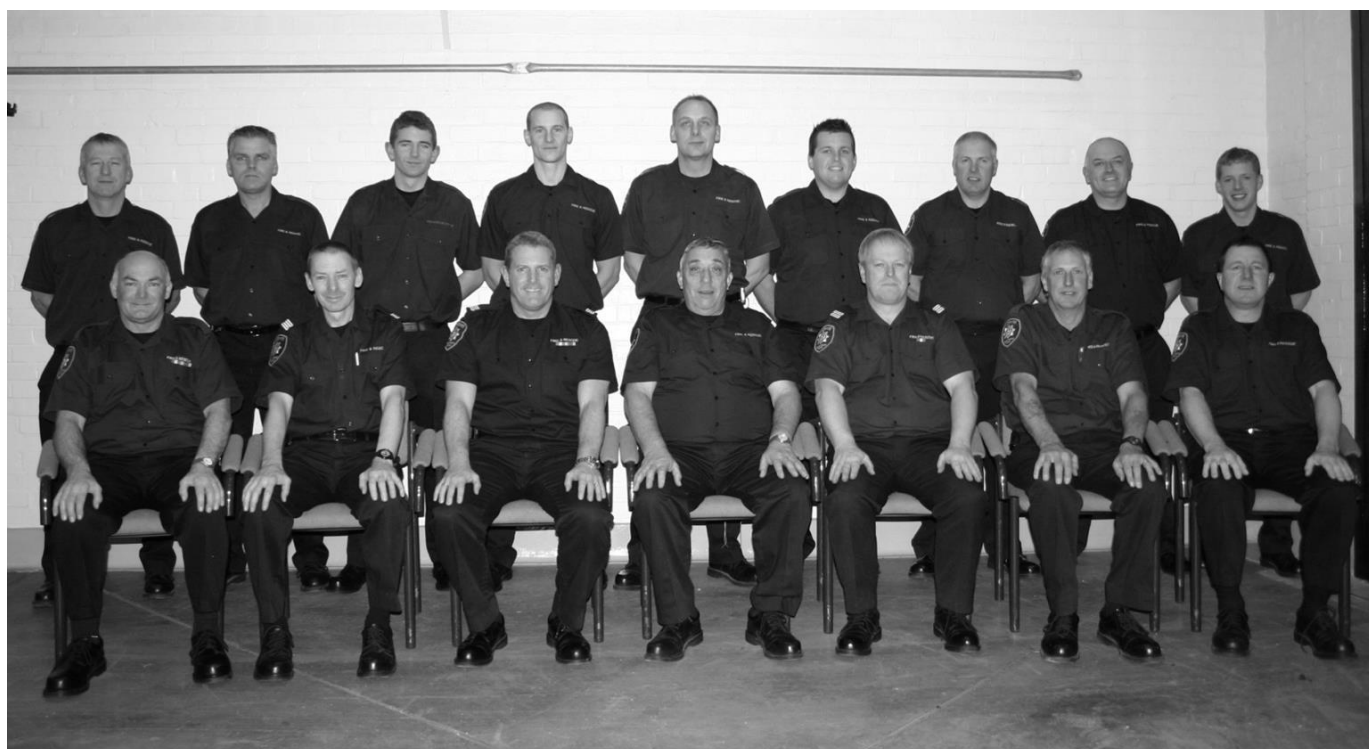
Fordingbridge firefighters December 2010