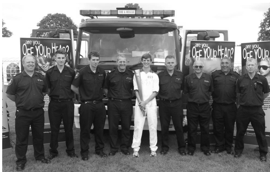
Fordingbridge firefighters & The Olympic Torch – 21 st July 2012