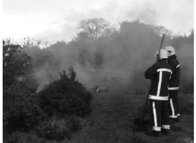
Fordingbridge firefighters pictured putting out some Forestry Commission 'Controlled Burning' that had got out of control due to a strong wind at Ditchend Bottom, Godshill – 9 th March 2011