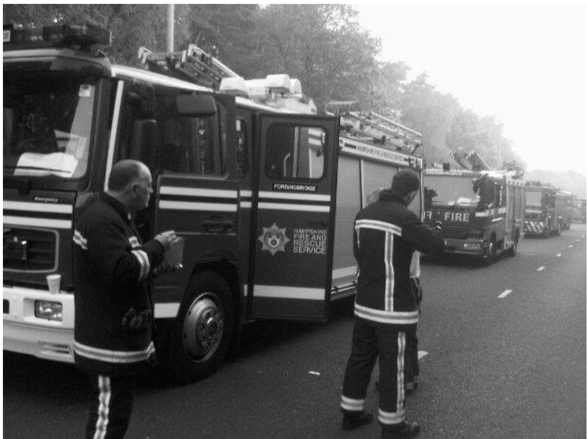
Fordingbridge's Water Tender Ladder lined up with appliances from London & Surrey Fire Brigades