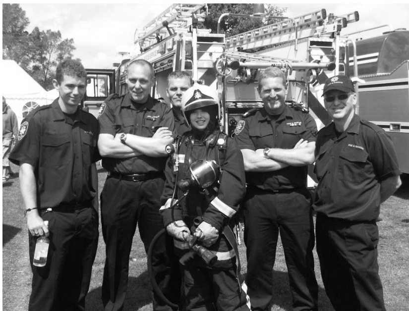
Fordingbridge Festival – July 2011