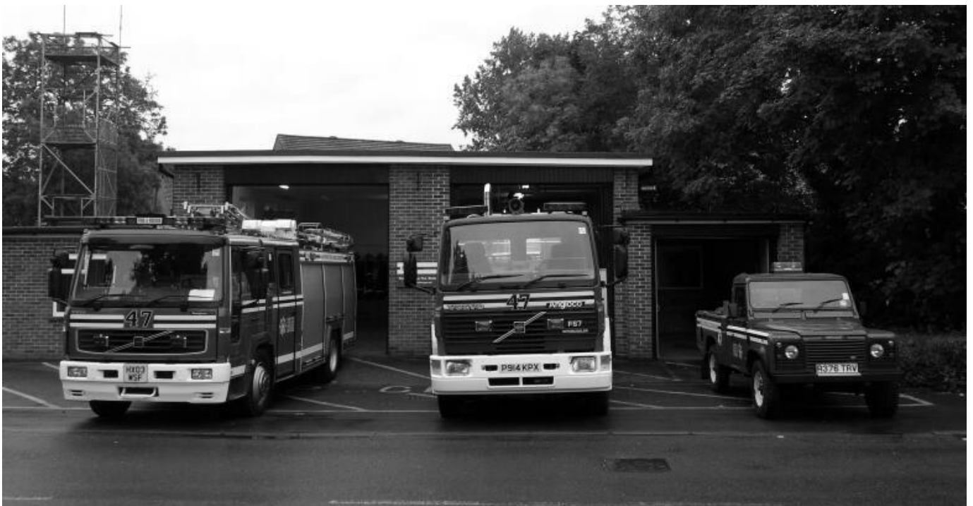
Fordingbridge Fire Station – September 2012