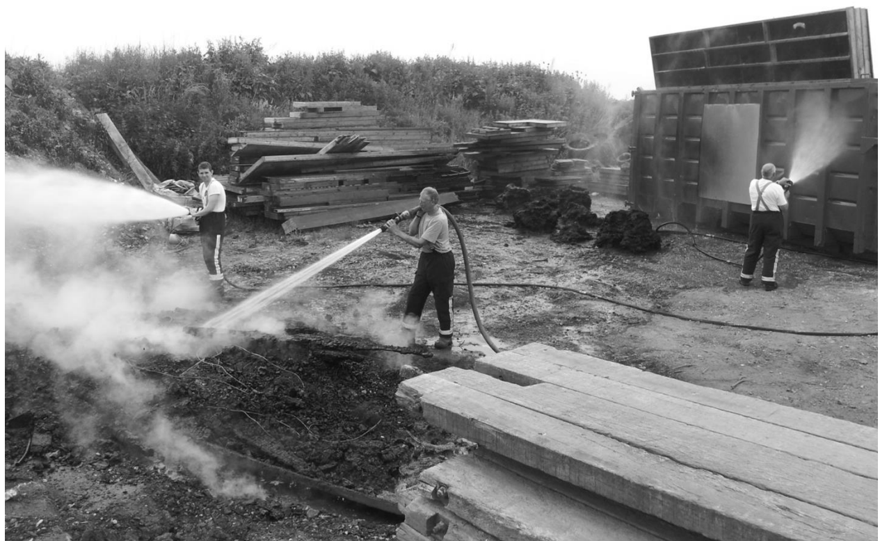
Fire in a builder's yard at Folds Farm, Godshill – 1 st June 2012